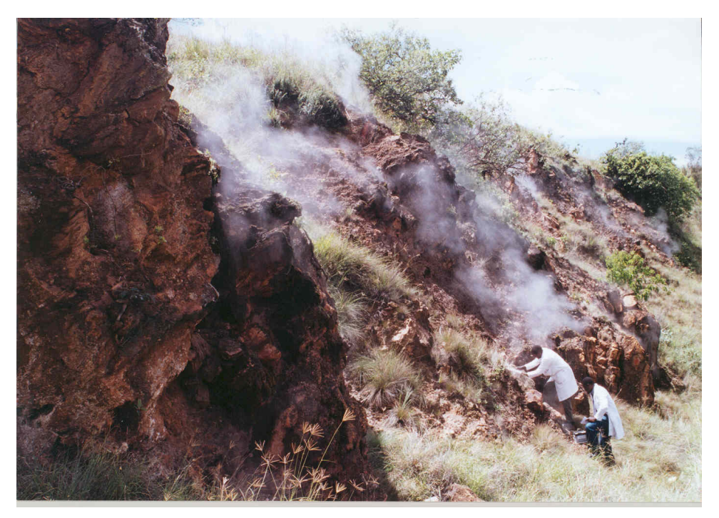
FIGURE 3: Fumaroles in the Kenya Rift

Surface manifestations in most geothermal fields consist mainly of fumaroles, springs and hot grounds (Arnorsson, 2000). Where the shallow ground water table is deep in the subsurface, springs are not available, for example, Figure 3, in Kenya Rift. When this is the case, water geothermometers cannot be used to predict the subsurface temperatures. This motivated the early scientists to develop gas geothermometers, e.g. D'Amore and Panichi (1980). There are 3 types of gas geothermometers based on;