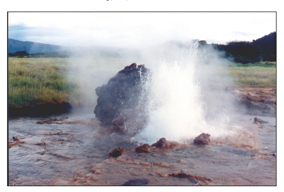
FIGURE 2: Hot geysers at Lake Bogoria geothermal prospect in the Kenya Rift

2. Conductive (no steam loss) – this equation represents experimentally determined solubilities and applies to those waters that cool solely by conduction during ascent. The silica quartz conductive cooling geothermometer is best used for springs at sub-boiling temperatures (giving a maximum estimate of the reservoir temperatures based on quartz solubility), or for well data that have been calculated to reservoir conditions.