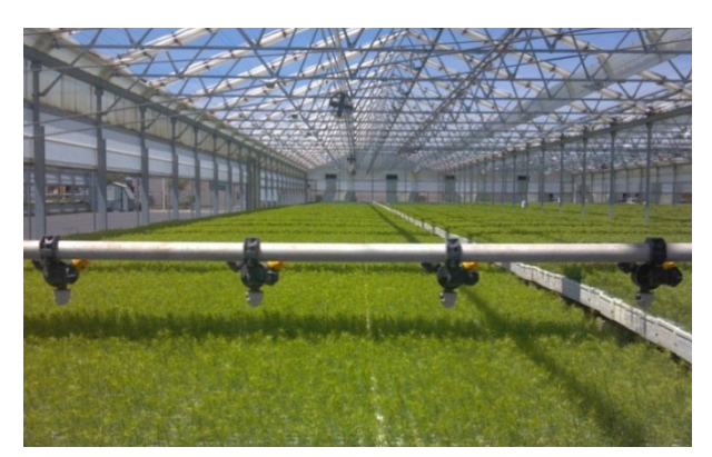
FIGURE 4: Tree nursery greenhouse in Klamath Falls

A tree nursery housed in a greenhouse in Klamath Falls uses heat from the city water to heat the greenhouse during the cold season. The tree seedlings are raised for up to 9 months and then sold for reforestation purposes. The tree nursery has its loop of water which exchanges heat with the city water. In addition, they also have a backup gas fired furnace which supplies the hot water when the city hot water supply