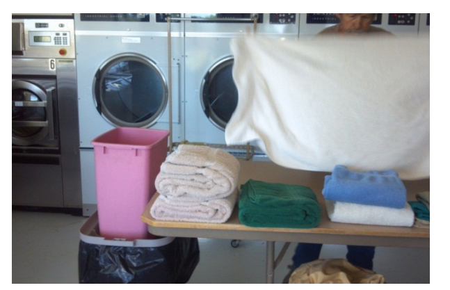
FIGURE 9: Geothermal laundry

The Canby community members have a common laundry where all the clothes for the members are washed using geothermally heated water as shown in Figure 9. Drying of the clothes is also done using geothermal energy. It is estimated that the community made up of 170 members saves about $16200/year from the use of geothermal in laundry as opposed to the use of propane.