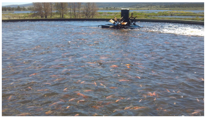
FIGURE 7: Tilapia farming tanks