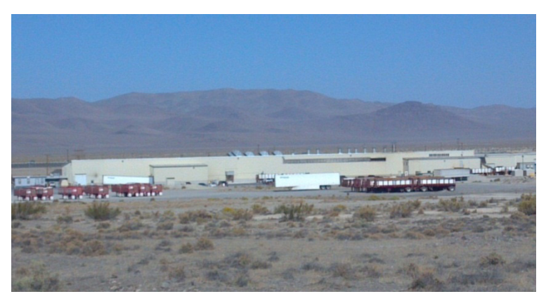
FIGURE 8: Onion dehydration plant

three stages to dehydrate the onions i.e. 120°C, 100°C and 70°C. Some