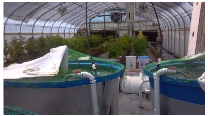
FIGURE 9: Canby Aquaponics Project

Aquaponics, a system of growing plants without using soil or fertilizer for the plants is employed. The spent water from the fish tanks, which is rich in ammonium, is filters and bacteria allowed to act on it so that ammonium is converted to nitrates, which in turn becomes food for the plants. The plants consume the nitrates and the resulting "clean water" is returned back to the fish ponds. Figure 9 shows the aquaponics