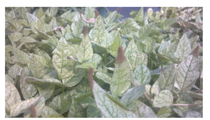
FIGURE 5: Spider mite farming at Liskey's Ranch

Liskey's greenhouses are used to grow Lima beans and spider mites for their eggs. The leaves of the lima beans are rich in chlorophyll which provides food for the spider mites as shown in Figure 5. The spider mite eggs are harvested and then sold as food for predator mites which are used for biological control of bugs in crops. The greenhouses are heated using hot water from geothermal wells at a temperature of 88°C-93°C and a flow rate of 25.3litres/s. The hot water is carried in finned tubes inside the greenhouse to provide a temperature of 32°C through radiant heating.