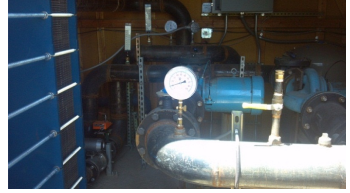
FIGURE 2: Klamath Falls heat exchange building. Some of the clients of the hot city water are 24 commercial and government buildings, greenhouses, sidewalk snow melt and a beer brewing company (Chiasson, 2006)

The geothermal water is pumped through a 1300m steel pipeline to the heat exchange building where it exchanges heat with city water as shown in Figure 2. The heated city water in a closed loop at 82°C is circulated in downtown Klamath while the geothermal water is injected back to the ground just outside the heat exchange building.