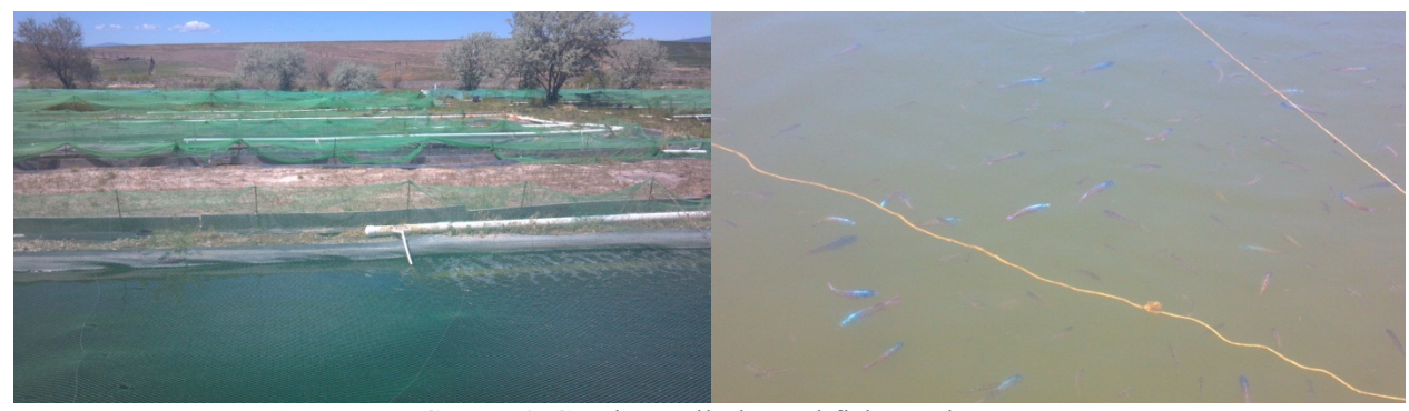
FIGURE 6: Geothermally heated fish ponds

This farm rears tilapia and tropical fish from Lake Malawi in Southern Africa. The water in the ponds is of geothermal origin and considered suitable for fish farming as shown in Figure 6. It is introduced into the ponds at about 90°C but after mixing with the cooler water in the pond, its temperature drops quickly to 28^{\circ}C \pm 2^{\circ}C . However, this requires varying the flow rate from 3.15-18.9 Litre/s depending on the ambient temperature.