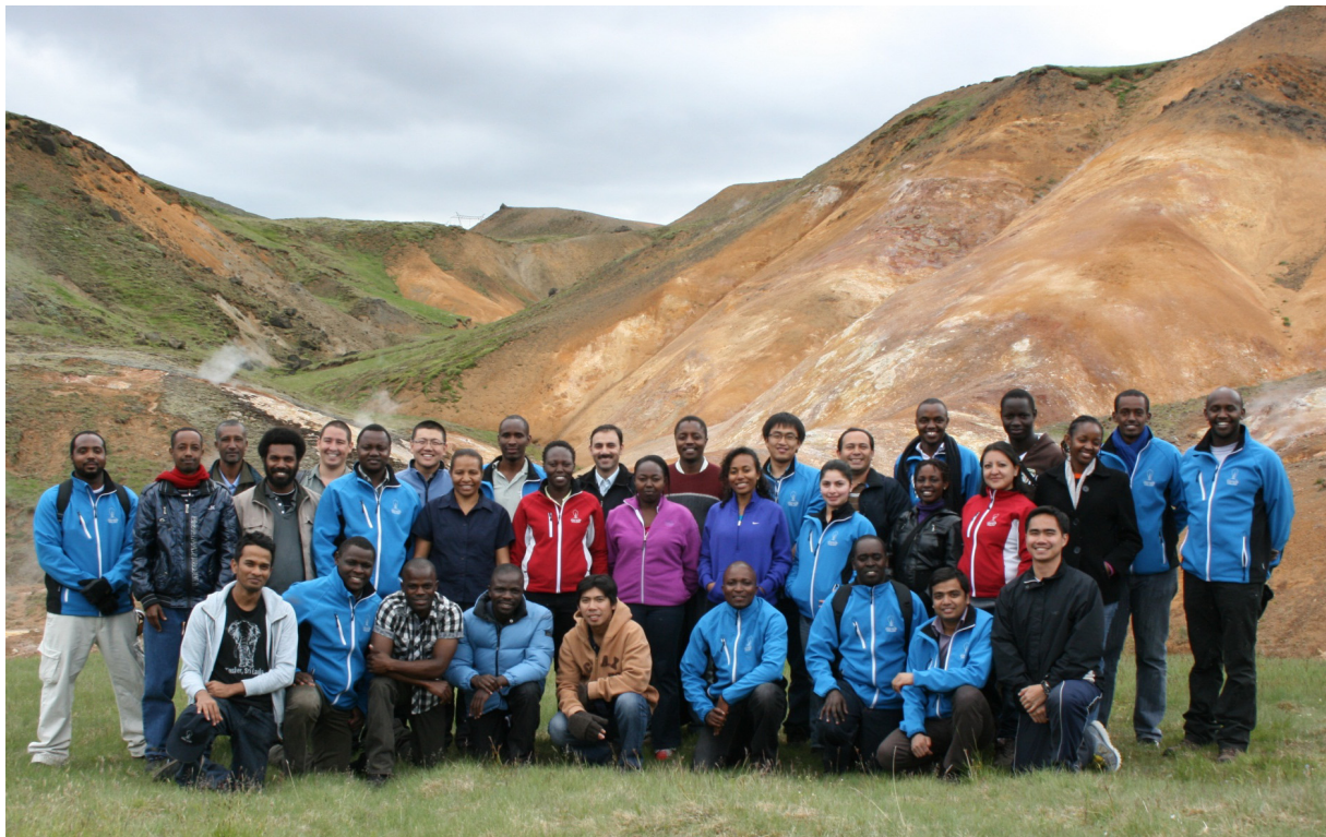
FIGURE 1: The group of UNU Fellows that attended the 6 months training in Iceland in 2012, at Ölkelduháls, Hengill, SW-Iceland

For more information on UNU-GTP, see e.g. Fridleifsson (2008, 2010) and Georgsson, (2010a, 2010b) or its web page ( www.unugtp.is ).