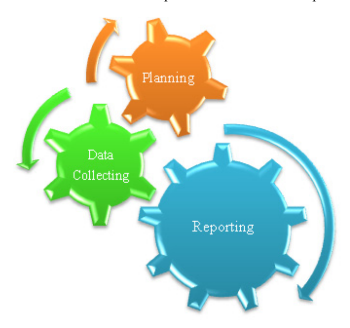
FIGURE 2: Phases of geological field mapping.

Field mapping projects are carried out in three phases which have a stepwise relationship.