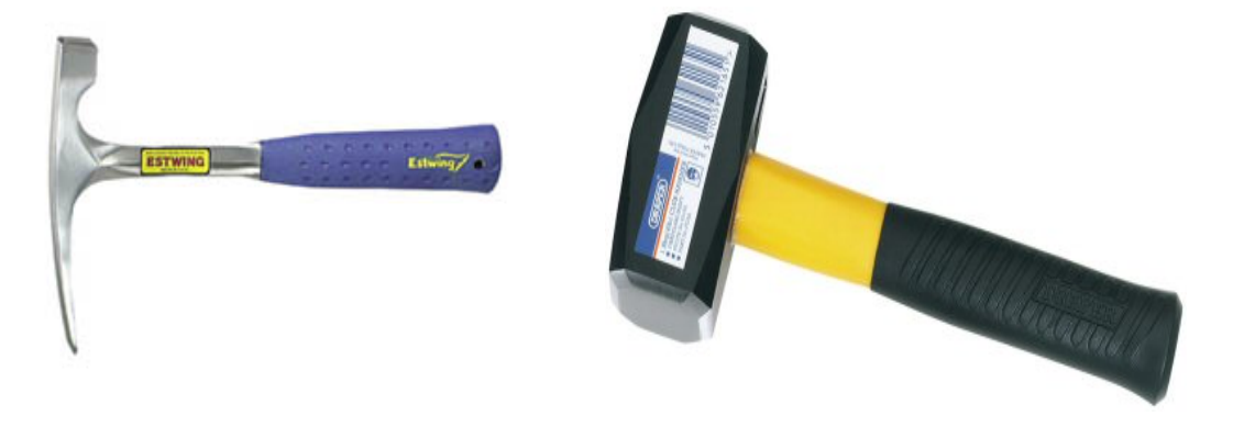
FIGURE 3: Chisel head and crack geological hammers

• Hand held lens is used to make the first analysis of rock samples in the field before further analysis is performed in the laboratories. The analysis needs to be detailed and descriptive giving