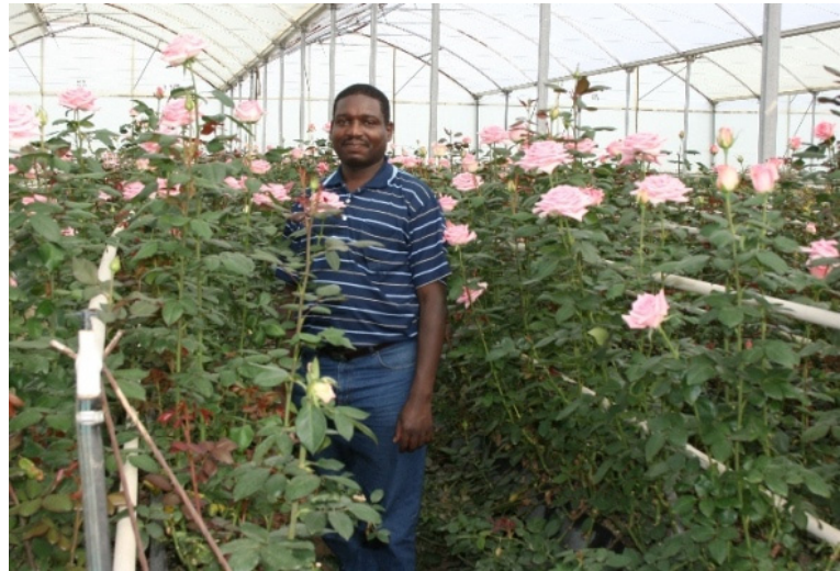
FIGURE 4: Roses grown in a greenhouse heated with geothermal at the Oserian farm, Kenya

In Ethiopia, the Aluto-Langano pilot power plant, built in 1998 for producing 7.2 MWe on-line, has been only in partial operation since few months after its opening about 10 years ago, with mechanical problems in the plant and limited steam supply being difficult problems to overcome. This led to no or low production for long periods of time. After restoration, the plant is now producing 3 MWe (Teklemariam, 2008).