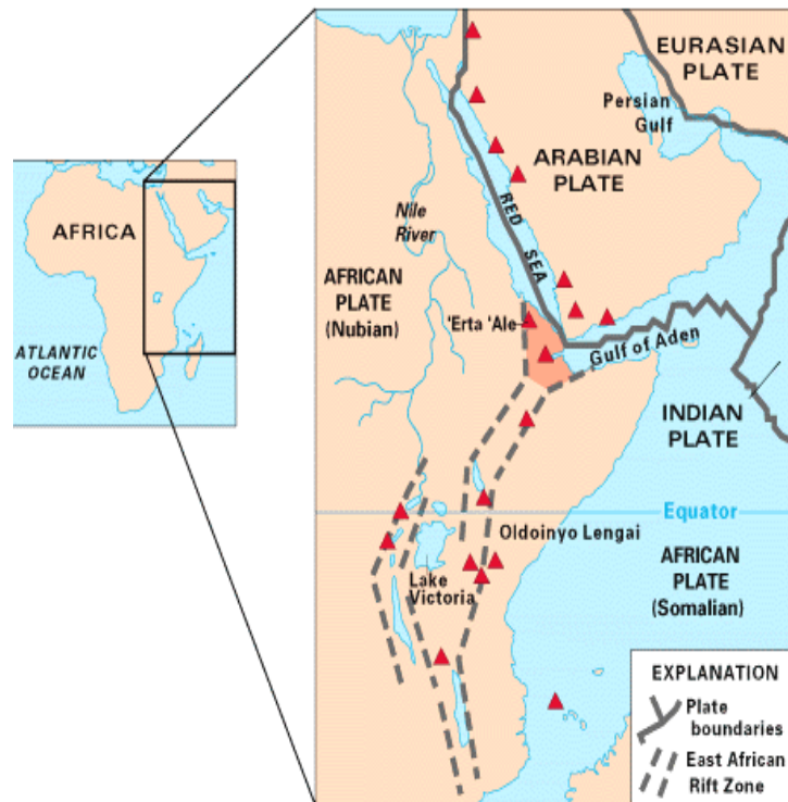
FIGURE 2: The Great East African Rift System (Teklemariam, 2008)

With the technology of today, East Africa has the potential to generate energy in the range 2,500-6,500 MWe from geothermal power (assessment by GEA, 1999). Despite that, Kenya is now the only country harnessing this resource to a significant extent. It has the richest potential, with geothermal potential recently having been evaluated to be able to supply more than 7000 MWe (Simiyu, 2010). Since the early 1980s, Kenya has slowly been increasing its total geothermal power generation from 15 MWe to 202 MWe at the Olkaria geothermal area in 2010 (Figure 3), with big increases scheduled in the near future. But more importantly, Kenya has put forward a very ambitious plan to reach a total of 1500 MW of geothermal power on-line in 2010 and the even more ambitious 4000 MWe in 2030 (Simiyu, 2010). It should also be mentioned that at Lake Naivasha, Kenya, geothermal water and carbon dioxide from geothermal fluids are used in an extensive complex of greenhouses for growing roses (Figure 4). Using geothermal heating to improve the quality of the products started in 2003. The Oserian farm is now (2010) the biggest geothermal greenhouse farm in the world, with 50 ha. of greenhouses being heated with geothermal to produce high quality cut flowers. Rose exports from this “geothermal” farm alone have totalled USD 300 million per year (Mwangi, 2005).