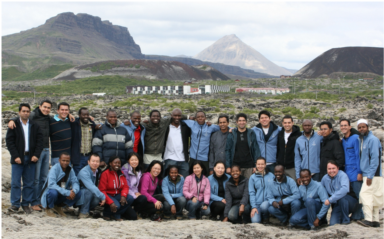
FIGURE 1: The group of UNU Fellows that attended the 6 months training in Iceland in 2011, at Bifrost, Borgarfjörður, W-Iceland

For more information on UNU-GTP, see e.g. Fridleifsson (2008, 2010) and Georgsson, (2010a, 2010b) or its web page ( www.unugtp.is ).