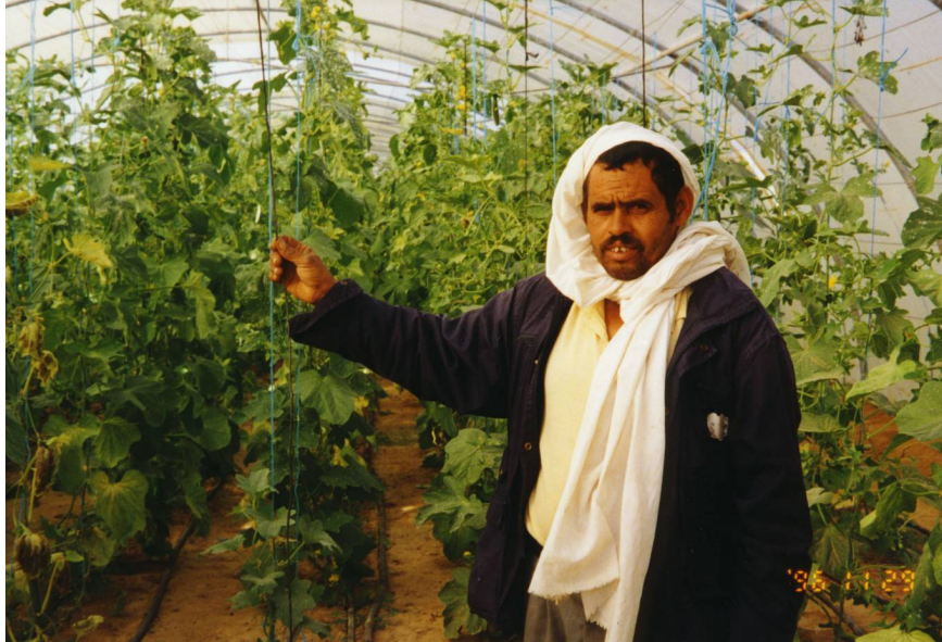
FIGURE 5: A geothermal green house in Tunisia, the hot water flows through plastic pipes at the ground surface

thousands of years. Direct use of geothermal energy is also recorded for Algeria, and Morocco has been exploring for geothermal resources, but Tunisia provides the example for the other countries of North Africa to follow (Ben Mohamed, 2010).