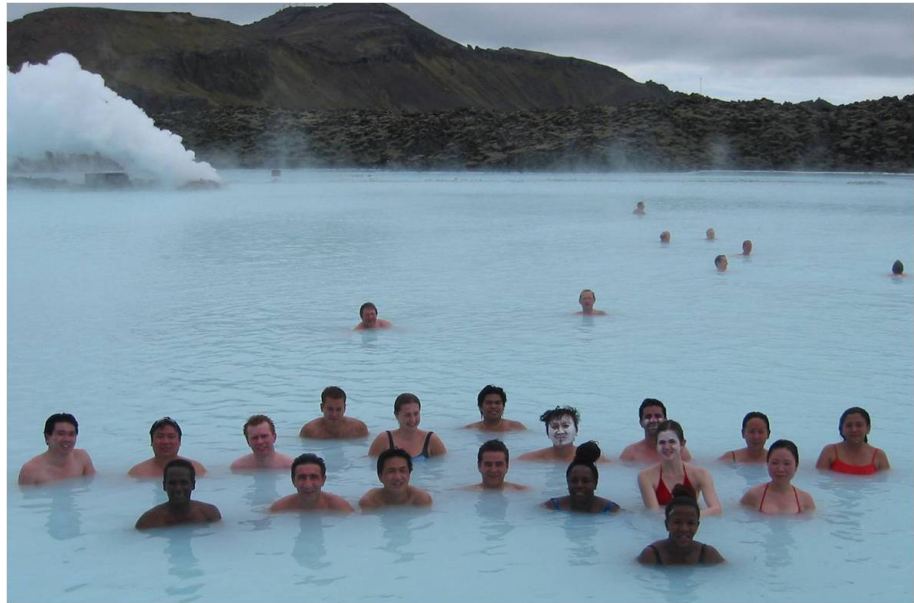
FIGURE 7: UNU Fellows bathing in the Blue Lagoon in 2003

To this can be added benefits such as snow-melting of pavements around houses, not forgetting the use of geothermal water for heating of greenhouses and for fish farming.