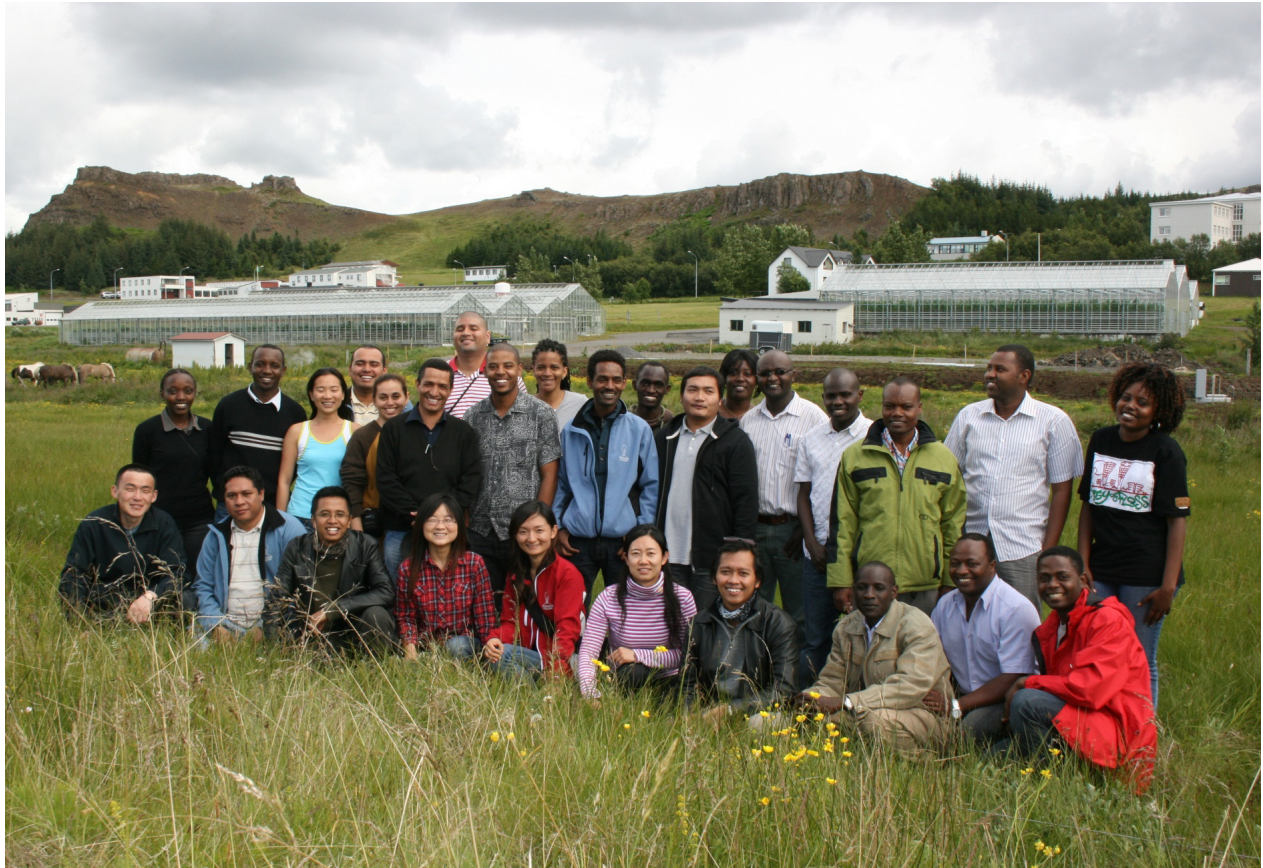
FIGURE 1: The group of UNU Fellows that attended the 6 months training in Iceland in 2010, at Varmaland/Laugaland greenhouse village, Borgarfjordur, W-Iceland

For more information on UNU-GTP, see e.g. Fridleifsson (2008, 2010) and Georgsson, (2010a, 2010b) or its web page ( www.unugtp.is ).