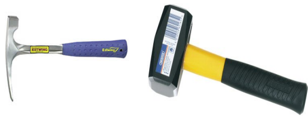
FIGURE 3: Chisel head and crack geological hammers