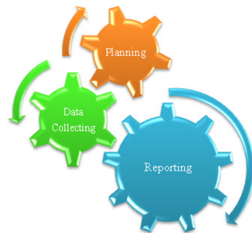
FIGURE 2: Phases of geological field mapping

This phase is focal in any geological field mapping and is carried out in the field for the sole purpose of collecting data. This data may be collected in the form of photographs, measurements, notes and physical samples. Therefore, one must be fully equipped with all the necessary tools, be physically psyched and mentally prepared to make note of not only geological features but of the entire surrounding. For example, phreatophytes may be used to locate structures especially when they grow in a certain alignment. When good strategy is involved during the planning phase, unfortunate incidences in the field are addressed promptly with no major disruptions of the field program. In tropical countries such as Kenya, it is advisable to plan for field studies during the dry seasons. Thus it is in the best interest of everyone to commence mapping work very early in the morning so as to accomplish a substantial amount of work before the temperatures rise too high. In colder climates such as Iceland mapping is usually planned for the summer and may begin at anytime of the day and