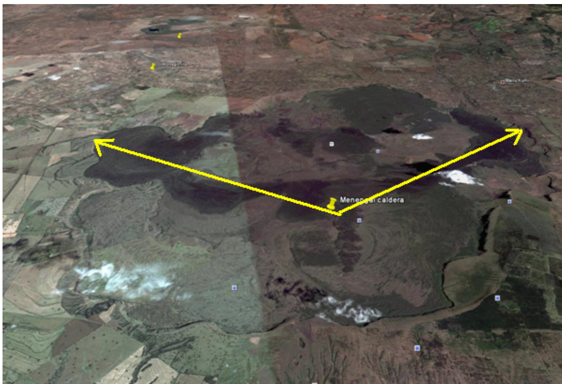
FIGURE 4: Satellite image of Menengai caldera. The dark lava flows on trachytic eruptive centres imply orientation to the northeast and northwest and these can be inferred as structures

Geological landforms. Geological landforms in this paper refer to features such as mountains/hills, calderas craters, canyons etc. The magnitude of these formations (usually large) can be estimated from aerial photographs and maps prior to the actual field work. The dimensions of these formations must therefore be obtained by actual measurement. The recommended method is to traverse the formation on foot while using a GPS to track the movements. For example, to map the dimensions of a caldera it is in best practice to first measure the rim by walking around it ensuring the GPS is in tracking mode. Since the elevation will be known by walking up the caldera one should then walk into it for further measurements. All lithologies should be mapped both in the interior and exterior of such formations. In some instances landforms such as calderas and craters may not be obvious on the surface due to erosion and weathering which may leave only a few exposures on the surface. If such outcrops are ignored it would be difficult to realise the connection if another exposure of the same kind is found in another location. Needless to say, a structure can easily be left out if work is carried out hurriedly.