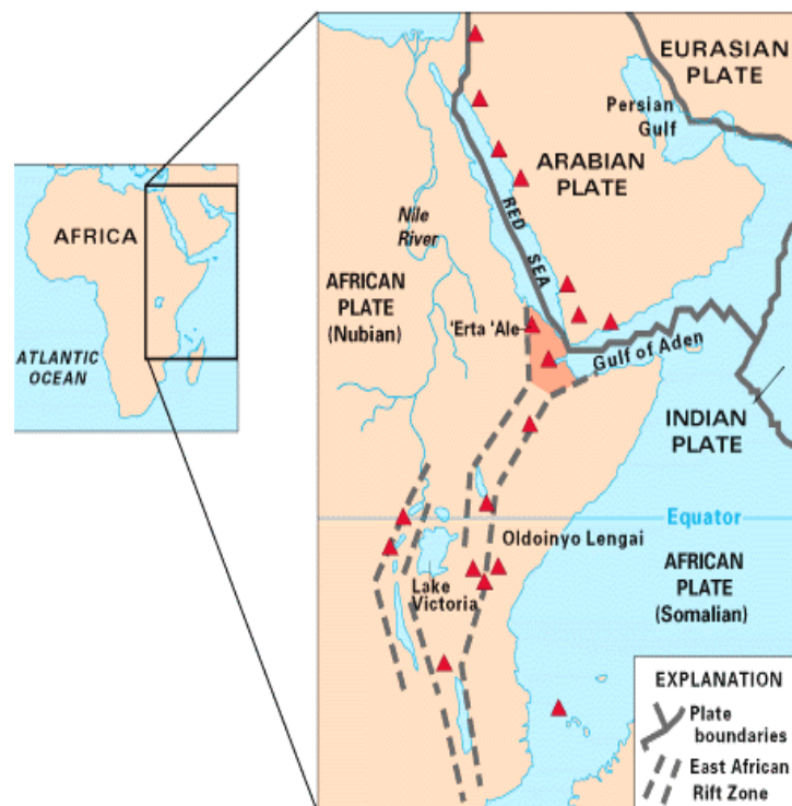
FIGURE 2: The Great East African Rift System (Teklemariam, 2008)

As seen in Section 3, the East African countries have similar energy production and consumption characteristics. Traditional biomass represents by far the largest category of energy produced (Table 4). The extensive use of combustible waste and biomass causes deforestation and contributes to environmental degradation. All the East African countries import petroleum products, mainly for transport and some for electricity production, which is not desirable in times of environmental awareness and high oil prices. Instead local renewable energy sources should be preferred, at least as far as conventional resources allow. For the countries surrounding the East African Rift System (EARS) (Figure 2) with its volcano-tectonic activity, high-temperature geothermal resources have the potential to play a much bigger role and even become one of