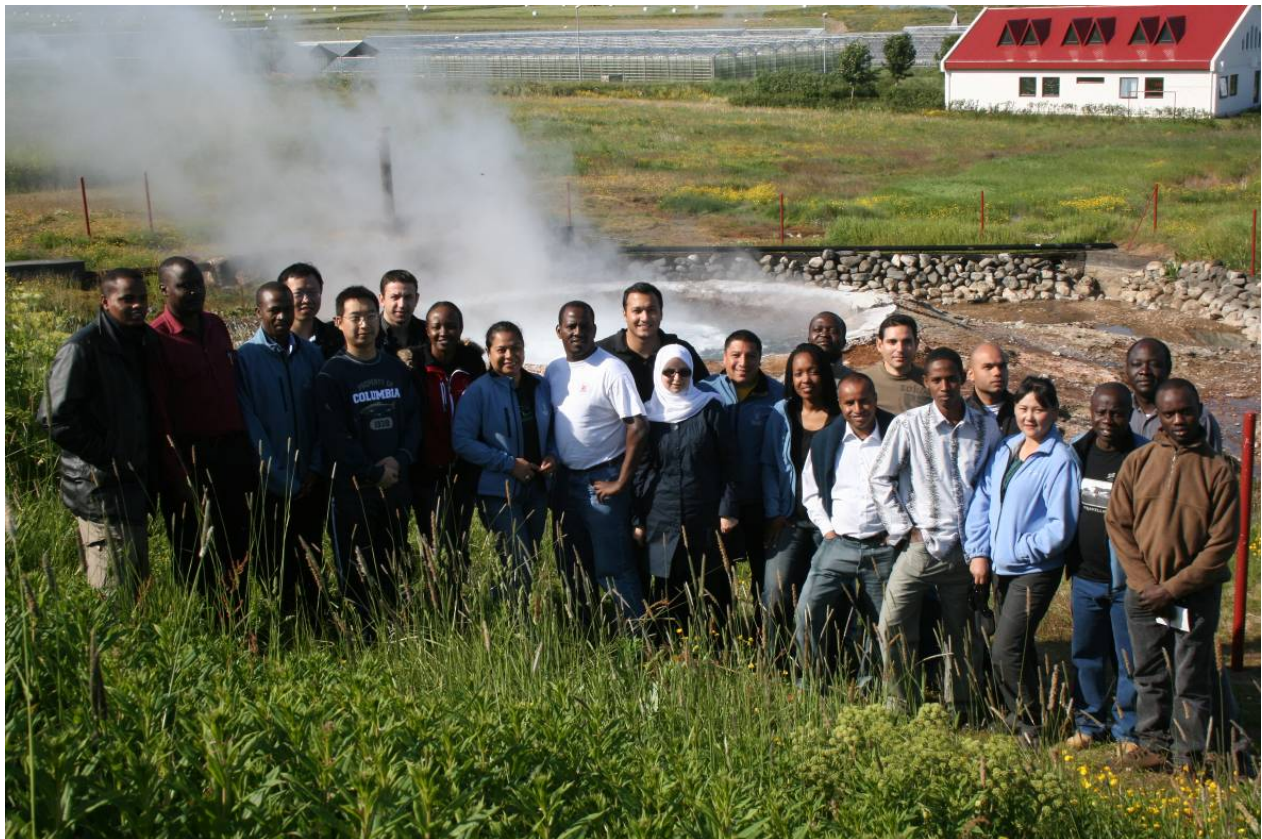
FIGURE 1: The group of UNU Fellows that attended the 6 months training in Iceland in 2009, at Ystihver geysir, Hveravellir, N-Iceland