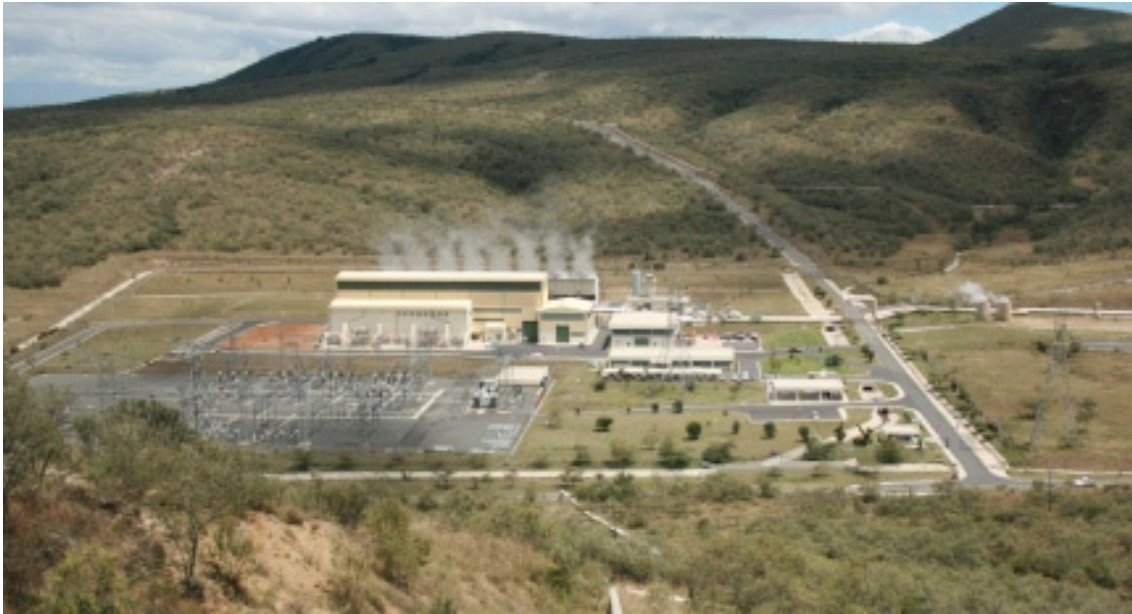
FIGURE 3: The Olkaria II power station in Kenya

the most important resources for electricity production. Currently, renewable energy sources (hydro, geothermal, wind, solar, etc.) represent only a small portion of the total primary energy production, averaging 2% for hydropower, geothermal and solar production combined (Teklemariam, 2008).