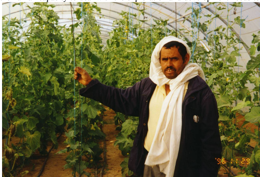
FIGURE 5: A geothermal green house in Tunisia, the hot water flows through plastic pipes at the ground surface

In North Africa, low-temperature waters for direct use have been utilized successfully in Tunisia where hot water intended for irrigation is cooled down in greenhouses thus allowing production of quality products, such as cucumbers and melons, mainly for export to Europe (Figure 5). In 2008, the total area heated in geothermal greenhouses in Tunisia reached 147 ha, making it one of the largest producers in