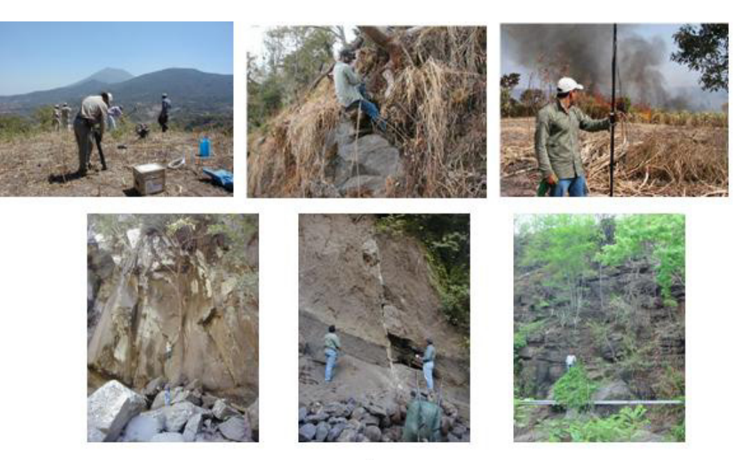
FIGURE 5: Working environments of the geophysicists and geologists in the Chinameca and Chilanguera areas

During the reconnaissance and prefeasibility studies, the geologists encounter geological risks while doing structural measurements. The geological outcrop to be measured are usually are in high slopes, negative slopes, or high fractured rock areas which can provoke small rock and land slides, while collecting samples or making a fault measurement. These events might put the specialists in danger; therefore, caution should be taken (Arevalo, 2006).