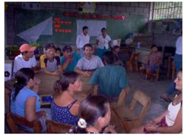
FIGURE 3: Meeting in the San Andres town with Geoplatanares and an education programme on the importance of geothermal exploration and its benefits